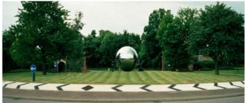
Kings Hill Parish Council

Please check the website or the notice board outside the Community Centre for details of the agenda for each meeting.